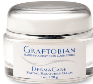
#12796 1 oz.

OxyDerm provides the skin with vital energy to keep it young and healthy-looking, containing several exciting ingredients to refine your skin, improve texture, clarity and tone, reduce puffiness, and improve the overall radiance of your skin. Directions: Gently massage into face and neck morning and evening to help deeply moisturize and firm the skin.