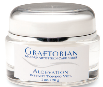
#12794 1 oz.

An innovative smoothing cream to instantly diffuse lines and wrinkles. Contains our proprietary natural stone and aloe complex for long-term benefits in the reduction of facial lines and in dermal hydration for a younger looking skin. Directions: Use in the morning following moisturizer. Apply a layer to face and neck blending downwards. Allow to dry prior to makeup application. Also makes a good primer for desert dry skin.