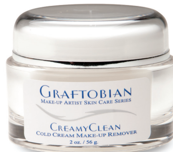
#12790 2 oz.