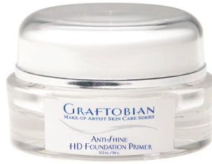
#12795 1/2 oz.

The perfect HD makeup foundation primer, especially helpful for use on skin types that tend towards the more oily side of the spectrum. Foundation primers do two things: First, they prepare the skin with a light barrier which helps to hold back oils from degrading the makeup, helping to keep a makeup looking good for several additional hours. Second, a good HD primer will give a slight tack to the skin, but a dry tack that will bond to both the skin on one side and to the makeup on the other, again to help hold the makeup for longer durability.