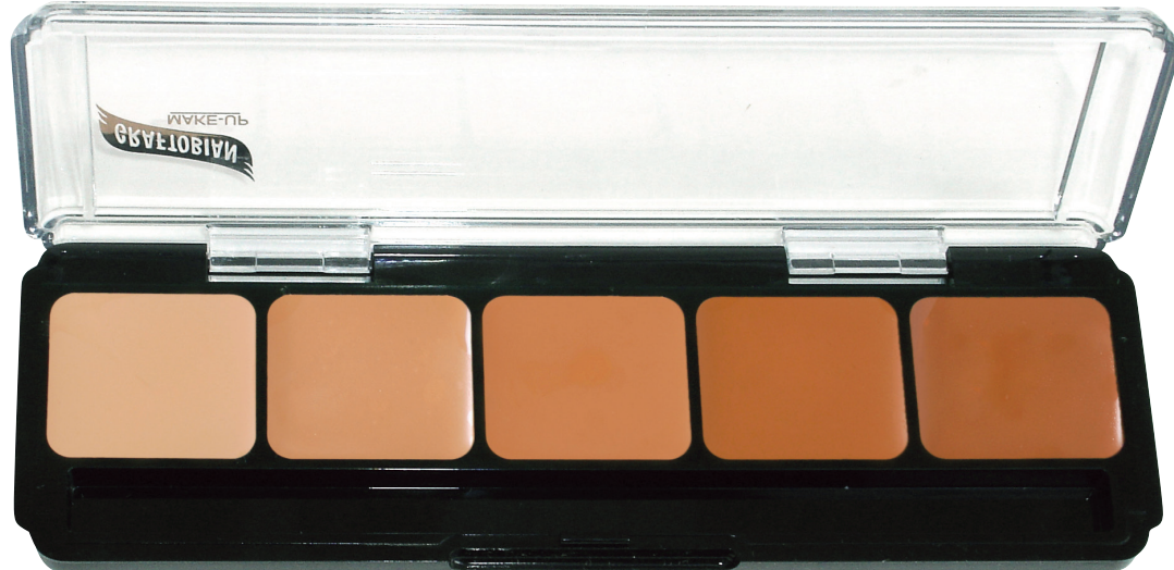
#30252 Warm Palette #2 shown actual size. Note: See page 24-25 for Lipcolor Palettes.

This countertop display is the perfect way to sell Graftobian HD palettes. The display holds three per style with sleeves and one without (often labeled as "Tester" to sell the others more effectively). Display is free when ordered with six of each style palette. "Tester" labels included upon request. -Limit one free display per store.