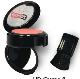
HD Creme & Powder Blush Tag

These shades of powder blush create a naturally radiant glow when swept across cheekbones and dusted lightly on nose and forehead. Sweep a small amount of blush over eye lids as well to make eyes appear more vibrant and alert.