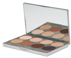
Cool Plus* #30232