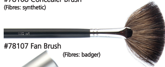
#78107 Fan Brush (Fibres: badger)