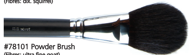
#78101 Powder Brush (Fibres: ultra fine goat)