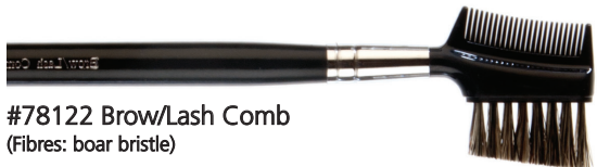
#78122 Brow/Lash Comb (Fibres: boar bristle)