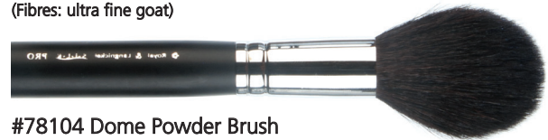
#78104 Dome Powder Brush (Fibres: ultra fine goat)