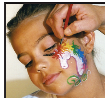
#88425 Foam Tipped Luster™ Powder Applicator